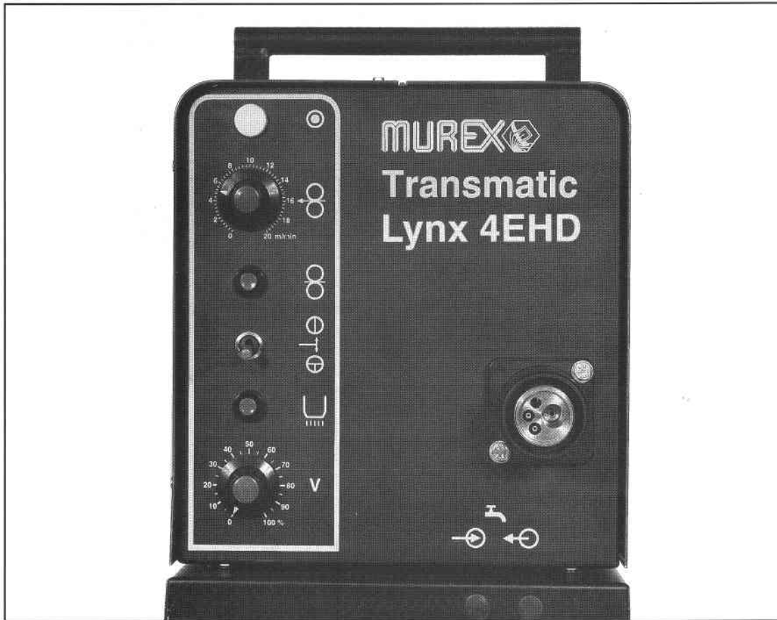
Fig 1 - Transmatic Lynx 2, 4HD & 4EHD